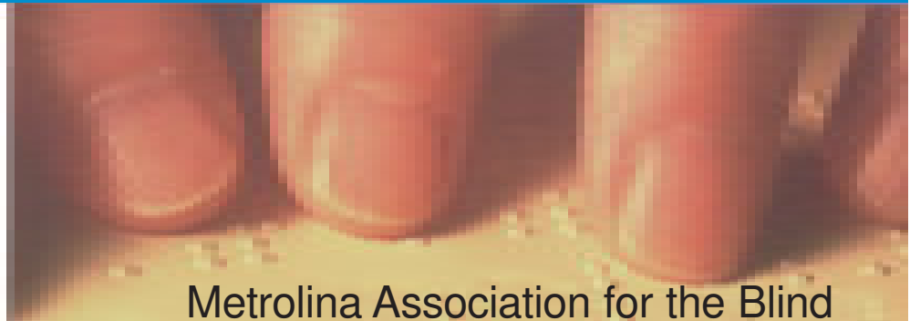
Metrolina Association for the Blind